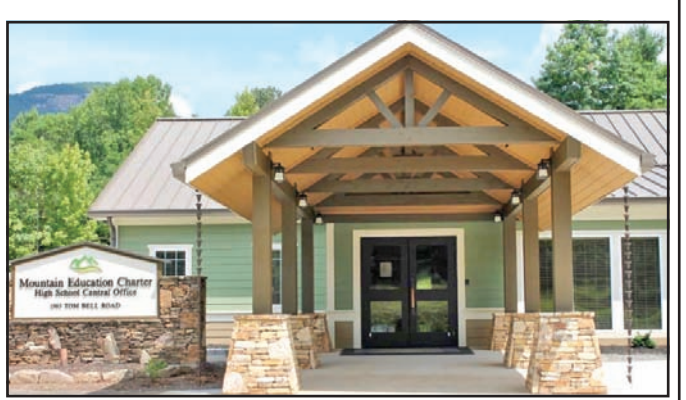
The new Central Office building for the Mountain Education Charter High School in Cleveland.

But having locations in 15 Georgia counties can on Sept. 29.