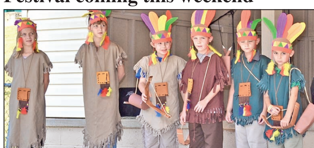
Little Indians performing during a past Indian Summer Festival.

By Jarrett Whitener North Georgia News Staff Writer SUCHES - Fall is